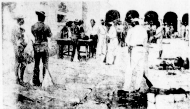
Drawing Of A Black Bean, Frederic Remington. The Will & Mike Hugg Collection, Museum of Fine Arts of Houston

Eastland Chamber of Commerce has announced the following entertainers will perform Saturday, June 7, at Discovery Fest '86. The stage will be on the south side of the courthouse.