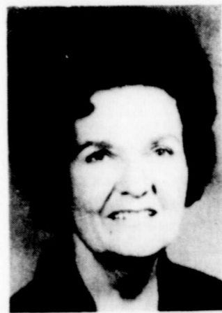
It's important that you vote SATURDAY, JUNE 7th.

The original play will be presented at Maverick Stadium as the finale of a full day's activities on Saturday, June 7.