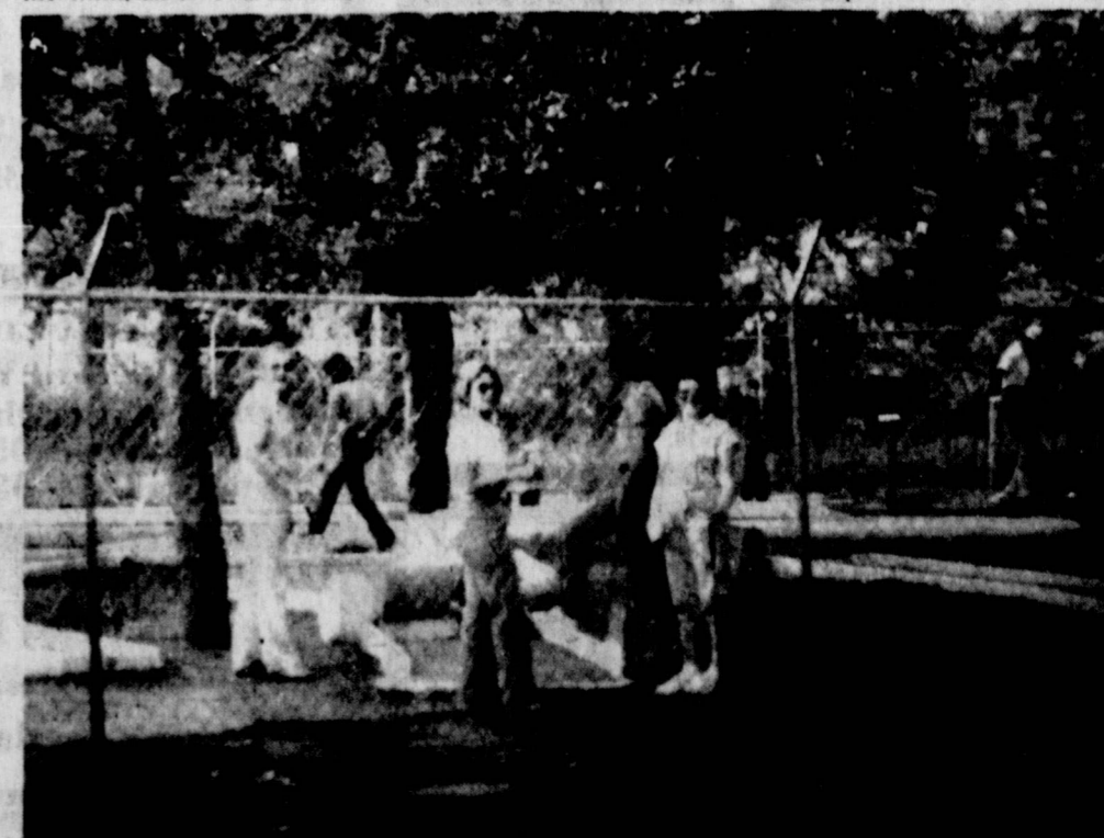
The 2nd Annual Kiwanis Club Golf Tournament will be held this year August 10-12.