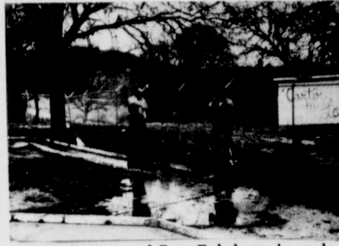
Linton Batteas and Gary Rabel are shown doing repair work at the old miniature golf course at Lake Cisco Park.