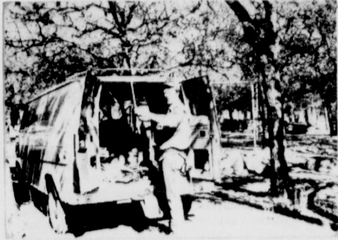
Larry Rambis of Rambis Electric is helping to renovate the old miniature golf course at Lake Cisco Park.