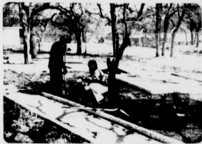
Virginia Wheatley and Maunia Copeland are helping the Kiwanis Club members to clean up the old miniature golf course at Lake Cisco Park.