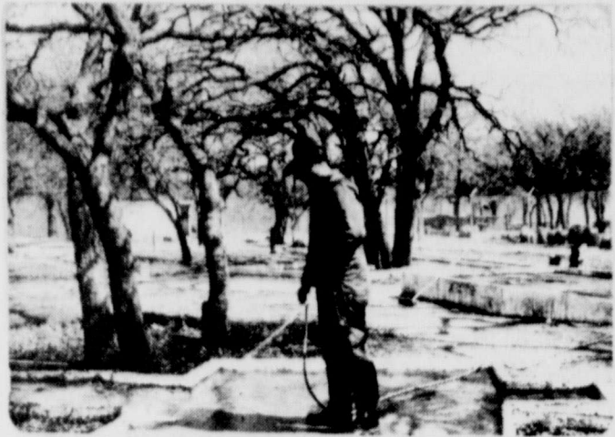
Don Copeland is shown cleaning the lanes at the old miniature golf course at Lake Cisco Park. The Kiwanis Club of Cisco and volunteers work each Saturday and Sunday afternoons.