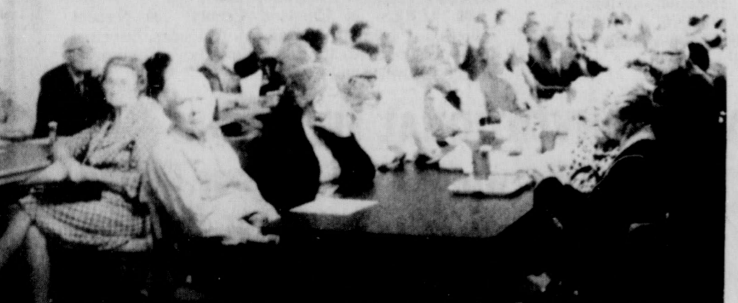
An eager group of 80 Plus Club members listen to the honoring of their friends.