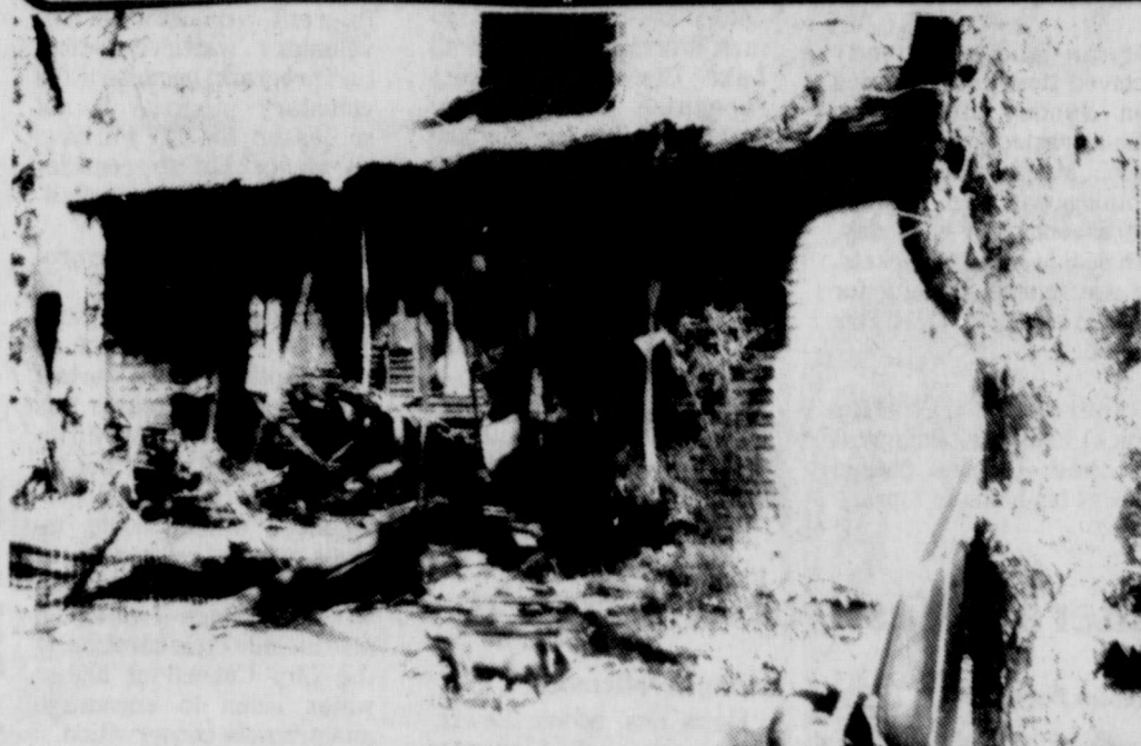
PATTON HOME AT 710 WEST 10TH STREET