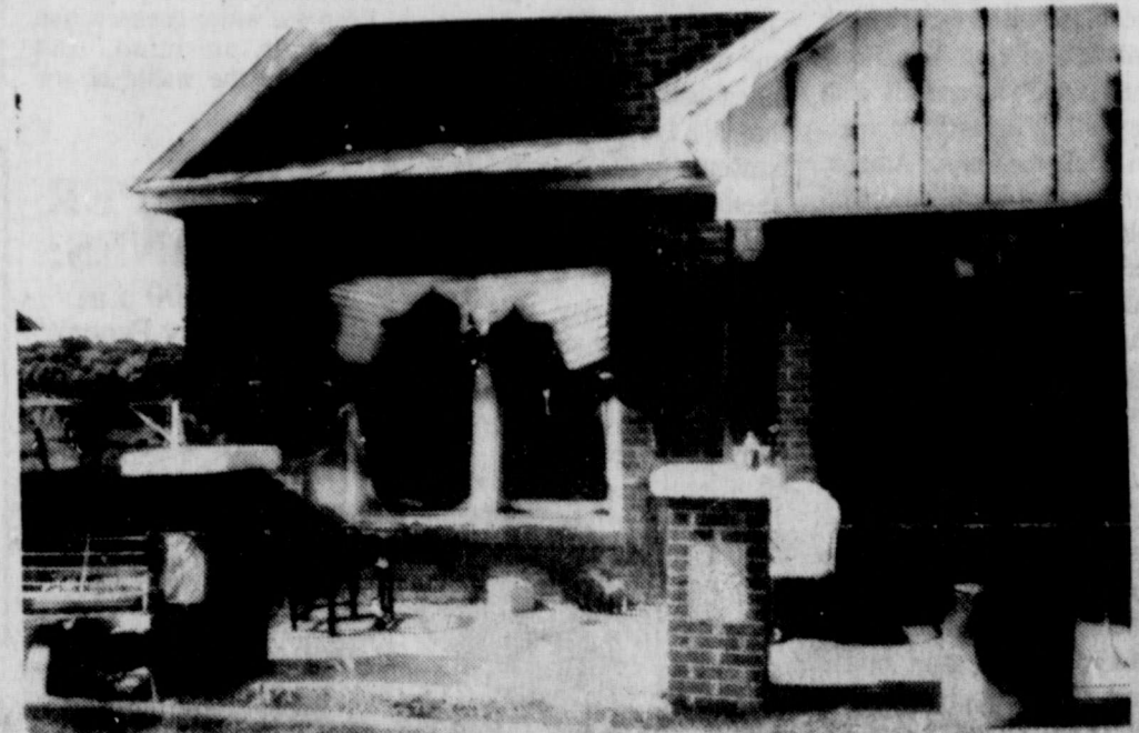
CHISOLM AND SCHRADER HOME AT 1508 MANCILL DRIVE