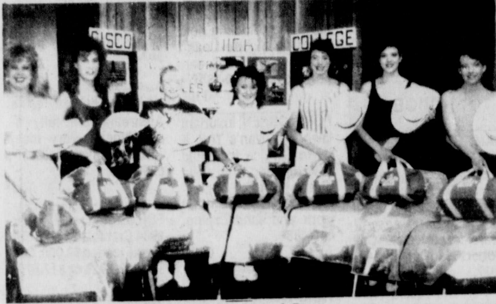
The Cisco Junior College Wrangler Belles and Band travel to Washington, D.C. and Winchester, Virginia, May 4-7, to perform at the White House and in the Shenandoah Apple Blossom Festival Parade. Accompanying the group is shown left to right in the above photo,