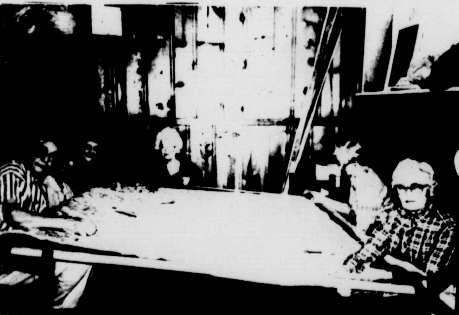
LADIES of First United Methodist Church are shown quilting, getting ready for the Sixth Annual Lord's Acre which will be held at the church Saturday, Oct. 15, beginning at 9 a.m. The church's delicious turkey and dressing dinner will be served at noon.

Along with the prestigious award, the recipients received a $100.00 scholarship from the Eastland County Home Extension Clubs.