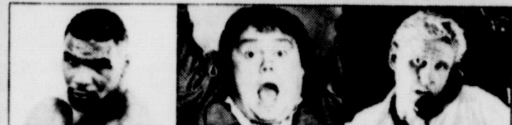
World Championship Boxing