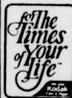
PHOTO PROCESSING AND PRINTING! 110, 126, 135 and disc. One Day Film Developing In By 11:00 a.m., Out By 4 p.m. Cotton's Studio 300 West 8th St. — Cisco — (817)442-2565 "Photography Is Our Business"

...Portraits ...Commercial ...Passport/I.D. ...Aerial ...Photo Copy and Restorations