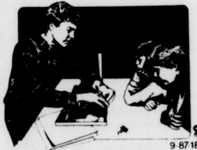
Sunday, October 11, 1987

B.I.O.N.I.C. Saturday, October 17, 1987 Camp Inspiration, Eastland, Texas