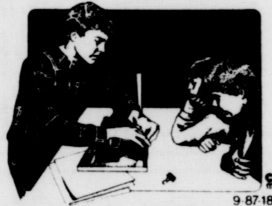
Sunday, October 11, 1987

B.I.O.N.I.C. Saturday, October 17, 1987 Camp Inspiration, Eastland, Texas