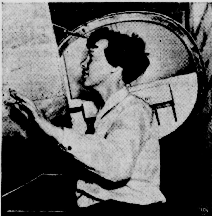
Strange voices of the radio calling "SOS" signals interpreted as belonging to Amelia Earhart's ship have been picked up

by stations which leads authorities to believe her ship is somewhere at sea or on an island helpless and without fuel.