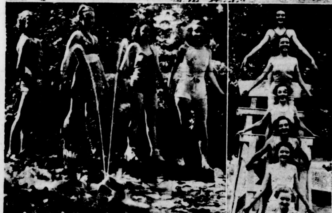
These beauties competed for the title of "Miss Cisco" Saturday night in the Tenth Annual Bathing Revue staged at Lake Cisco. Monday night "Miss Cisco" will compete with beauties from other towns for top honors in Central West Texas. An all day program at the lake, usually attended by from 10,000 to 20,000 persons, will precede the final selection Monday night.