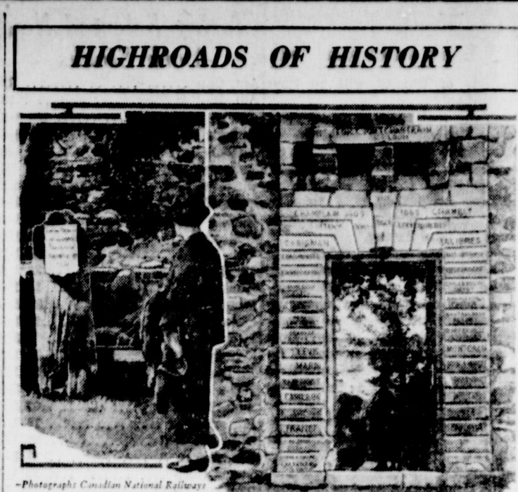
HIGHROADS OF HISTORY... THE only monument in Canada erected by Daughters of the American Revolution stands in Fort Chambly which is about twenty miles southwest of Montreal on a conspicuous headland of the Richelieu River.