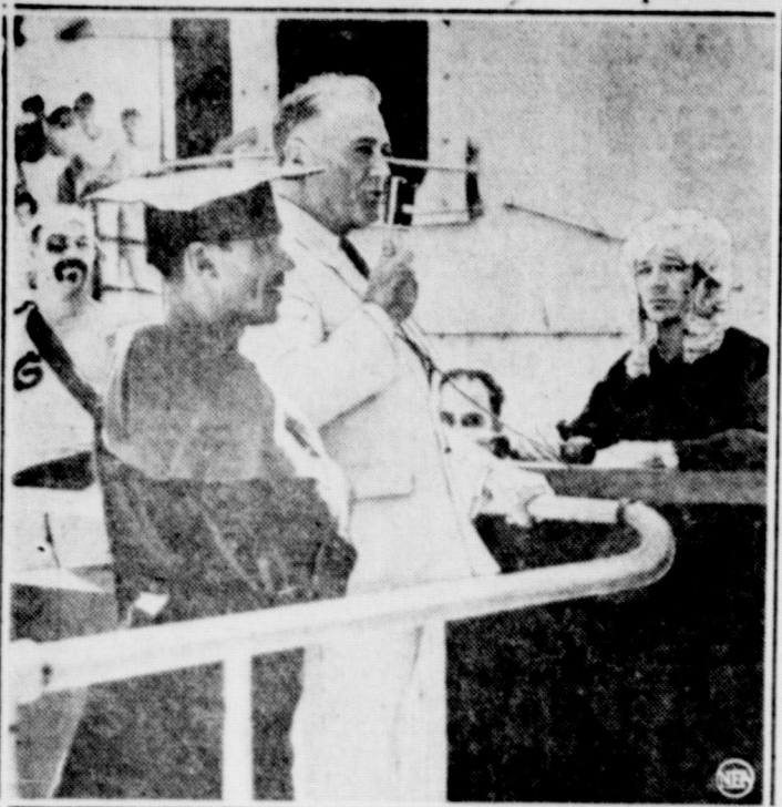
Being President didn't save Franklin D. Roosevelt from the traditional trial, during his trip to Buenos Aires, before King Neptune's court as a novice at crossing the equator. Here he is seen pleading his case aboard the U. S. S. Indianapolis when "Davy Jones" accused him of "gross incompetence in failing to carry Maine and Vermont" in the last election.