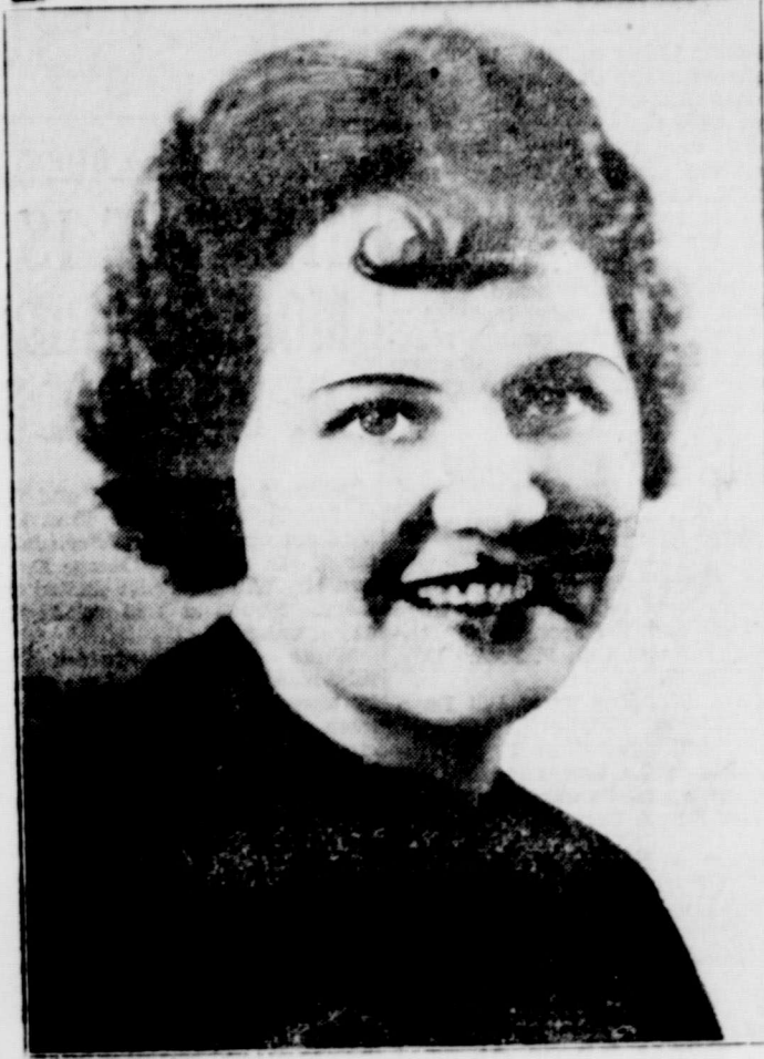
Leading lady of Billroy's Comedians who will appear in Cisco Wednesday, Nov. 11. One night only at Avenue D and 10th Street. One performance only at 8 p. m.