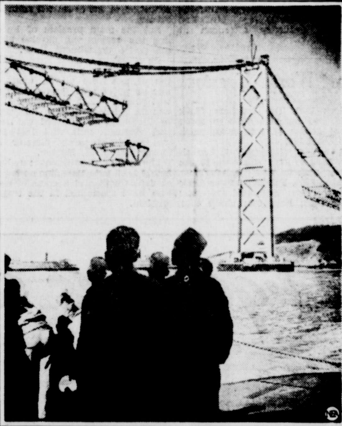
Swinging high above the waters of the bay, this huge fabricated section of the steel deck frame of the San Francisco-Oakland Bay bridge is being hoisted into place by traveling cranes. Moving far overhead, the cranes lift the section slowly upward from the barge on which it had been taken into the bay. By this engineering feat, all the framework for the two decks to carry nine lanes of vehicle traffic and two interurban tracks will soar into place, to be bolted and supported from the suspension section.