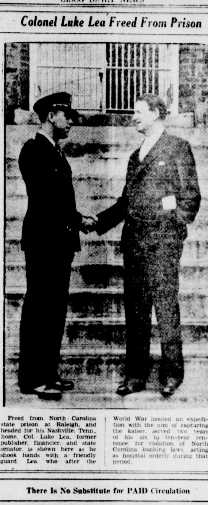
Freed from North Carolina state prison at Raleigh, and headed for his Nashville, Tenn., home, Col. Luke Lea, former publisher, financier, and state senator, is shown here as he shook hands with a friendly guard, Lea, who after the