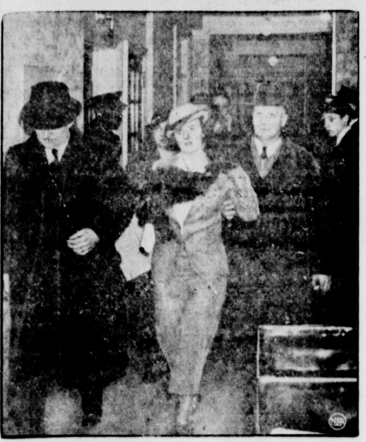
Striving against collapse, Mrs. Anne Hauptmann is shown here as, supported by friends, she left her hotel in Trenton, N. J., to seek refuge with her baby in New York, a few hours after her husband went to his death in the electric chair. She had regained some composure, following her first outburst of grief, in which she locked herself in a bathroom, where friends feared she would end her life.