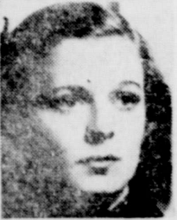
Carl Laemmle presents MARGARET SULLAVAN in her most glorious triumph