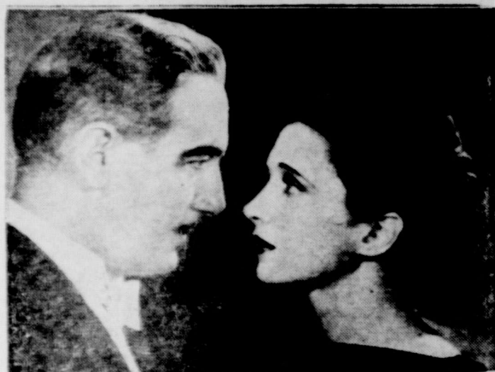
Kay Francis has one of her loveliest scenes with Paul Lukas, noted screen lover, in the First National picture "I Found Stella Parish," one of the most exciting dramas of the season which opens at the Texas theatre today for a two day run.

STUDENT MINE BUILT SALT LAKE CITY — (U.P.) — Fifty National Youth Administration workers began construction of a full-sized mine at the University of Utah, but they don't expect to find any gold. The mine will be used by mining and engineering students in tests for ventilation, surveying, timbering and other forms of mining activity.