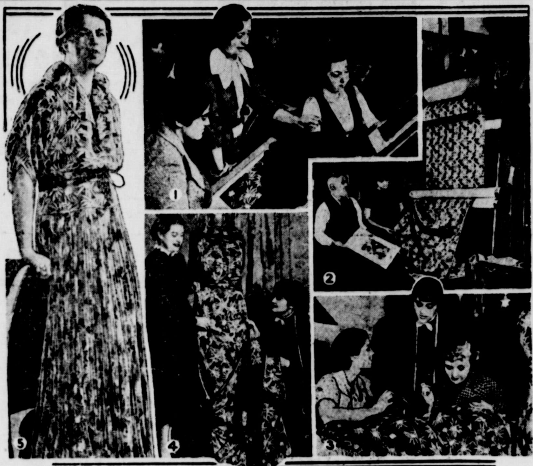
PHOTO 1 shows New York High School students, as they start competition in silk design contest with prize-winning designs to be put in production and exhibited in leading art galleries and museums throughout the country...