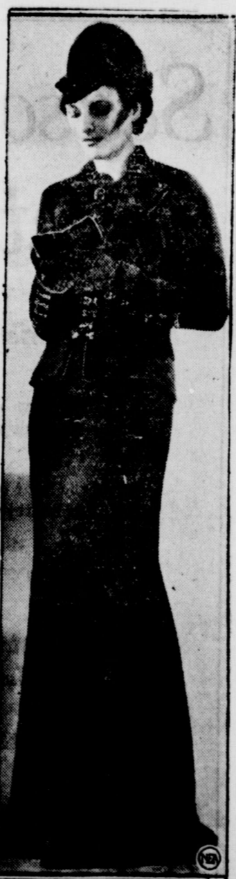
Gift hooks and eyes trim the sleeves and fasten the jacket of this new LeLong example of the midnight suit, made of black cloque.

incident with the rise of Chinese industrial firms manufacturing products which compete on the open market with goods from the chief foreign nations. At the inauguration of the new group, attended by more than 400 representatives of Chinese commercial and industrial groups, a resolution was adopted calling for the issuance of a public letter to people all over the country, urging them to buy and use Chinese products only.