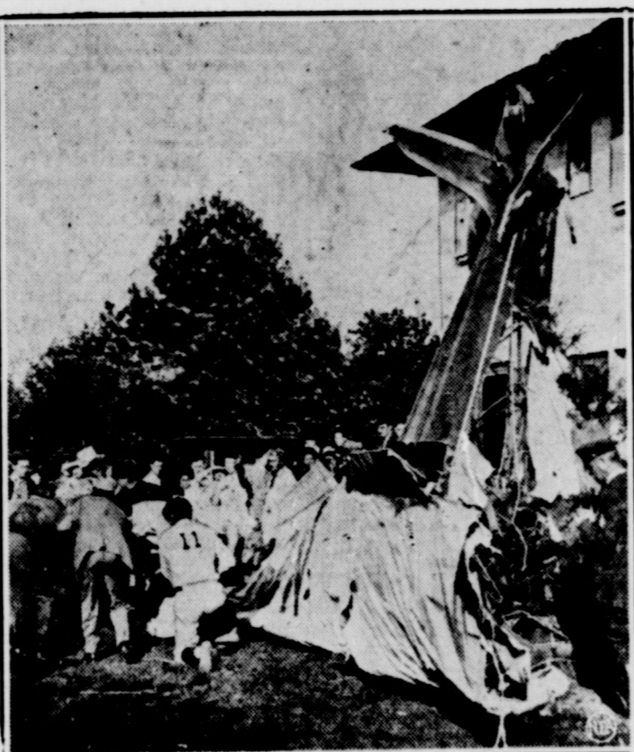
Put into a tailspin from which Friedel Braun, flying waitress, was unable to right it, her plane spun 1,200 feet downward while her horrified fiancé looked on, struck the roof of a house at the edge of ex-