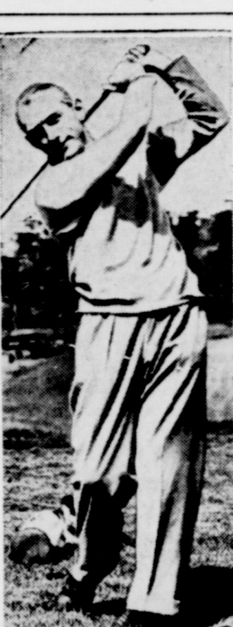
Tommy Armour, shown driving, knows his way around the treacherous course of the Oakmont Country Club, scene of the National Open golf championship, which opens today. The veteran Scotsman defeated Light Horse Harry Cooper in a playoff for the title over the Pittsburgh layout in 1927.