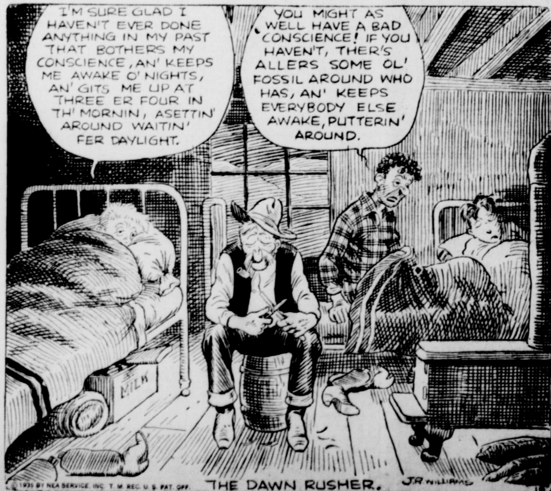
THE DAWN RUSHER.