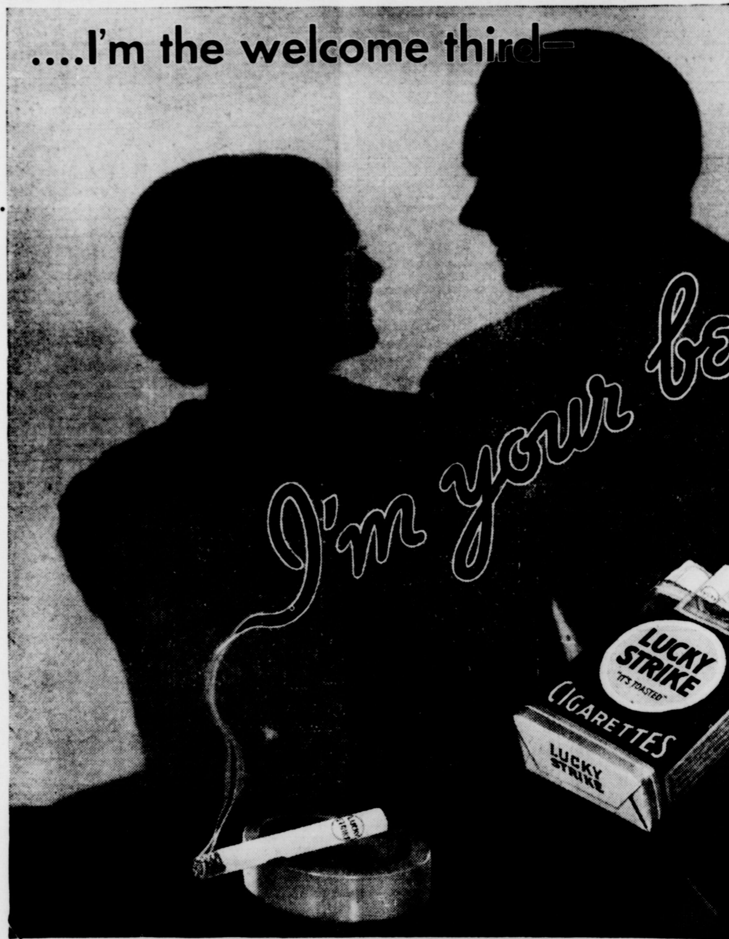
Copyright 1950, The American Tobacco Company.