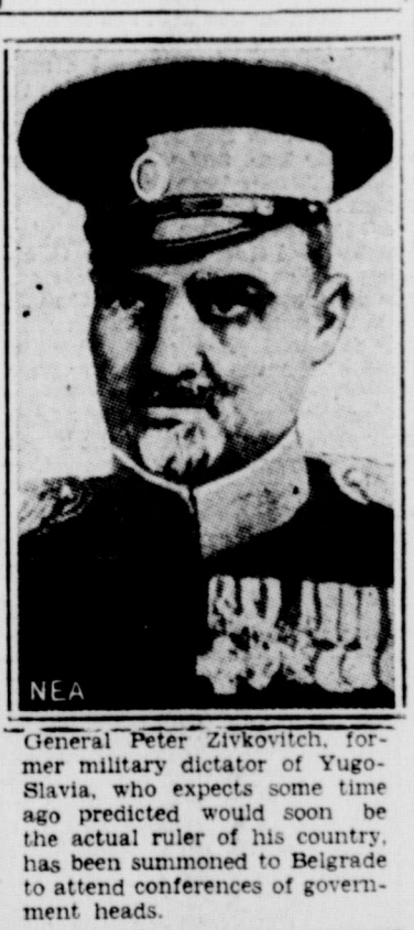
General Peter Zivkovich, former military dictator of Yugo-Slavia, who expects some time ago predicted would soon be the actual ruler of his country...