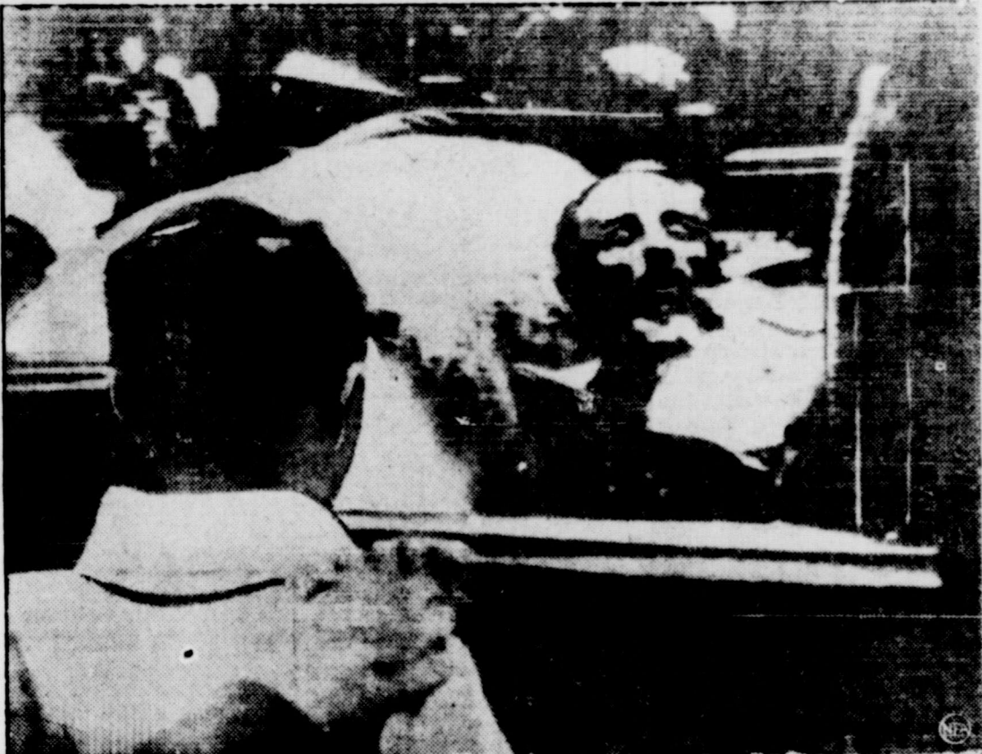
Dying by an assassin's bullet, King Alexander I of Yugo-Slavia lay slumped in the seat of the automobile in which he was making a triumphal entry to Marseilles, France...