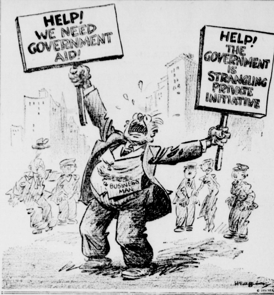
That Individualist, Mr. Borah of Idaho