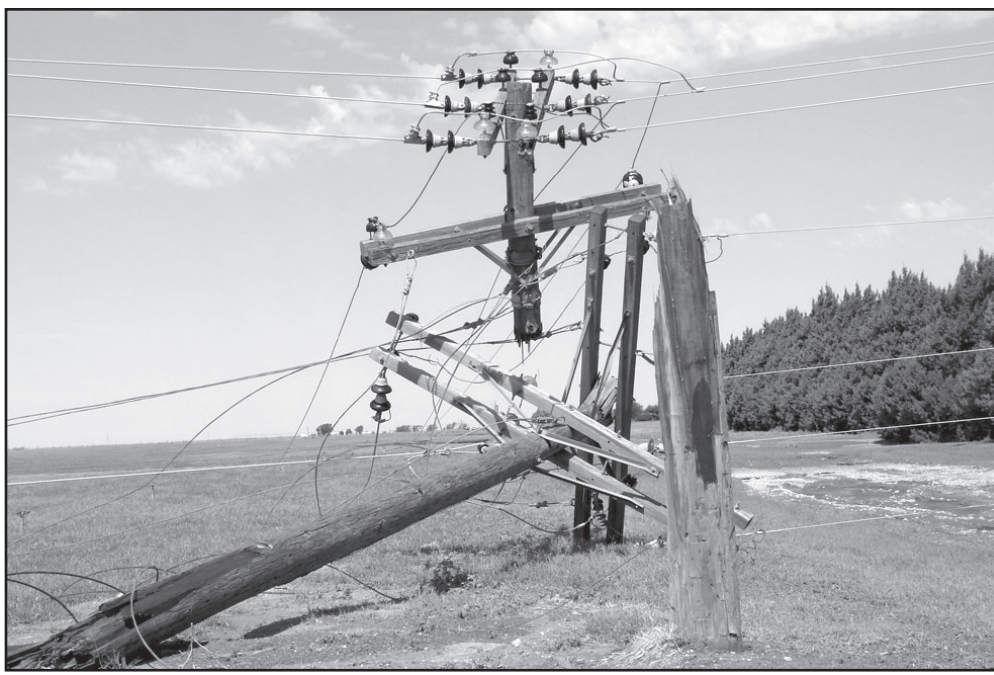
BCEC's recent storm damage included more than 400 utility poles. Pictured above, the power lines hold up the pole, while below linemen arrive at a damage area.

According to Muleshoe police officers, one of the surprising events of the stormy weather occurred during Thursday's storm, as rainwater pooling in the area of W. American Blvd. and 12th Street carried utility poles being used to block off a parking lot down the road, requiring officers to "herd" the poles back into place.