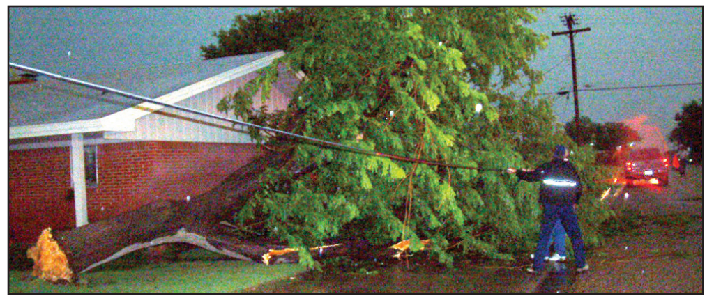
City employees attempt to free a telephone line pulled down by a tree on Ithaca.