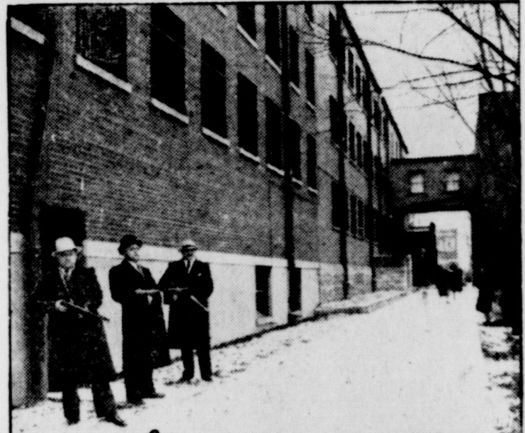
This "model, escape-proof" Lake county jail in Crown Point, Ind., could not hold John Dillinger, the nation's "No. 1 outlaw," who made a daring escape, freeing a negro murderer with him, despite the strong guard posted around the prison, three members of which are shown here. In the background is the bridge over which Dillinger would have been taken to the criminal court building, at right, for his trial, without going into the street. The view at the right gives a striking character study of Dillinger as the cunning, ruthless desperado who has spread terror across many states.