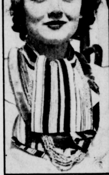
Looking rested—and pleasant, as when doesn't she?—Myrna Loy, film actress, is pictured here upon her return to Los Angeles from a month's "hideaway" vacation in Hawaii.