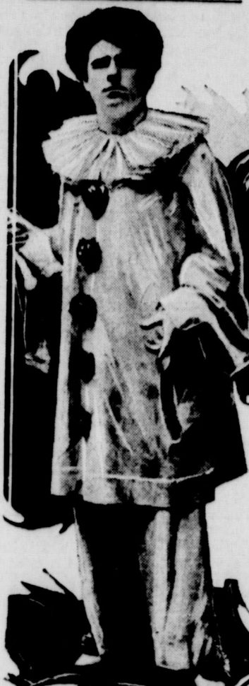
Giovanni Martinelli as Canio