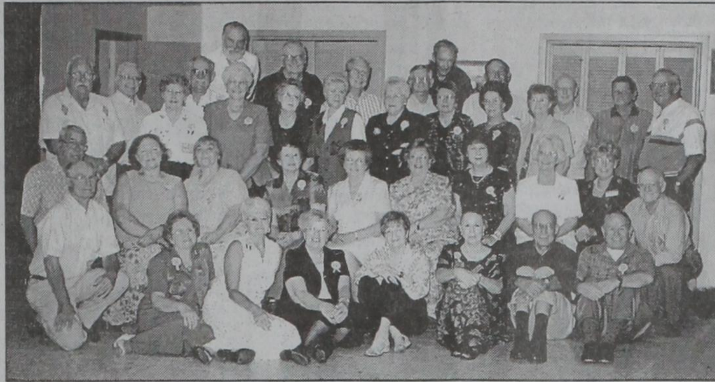
Pictured are members of the MHS Class of 1953.

The banquet was attended by 65 classmates, spouses and friends. A moment of silence was observed honoring each departed classmate. As each name was read, a