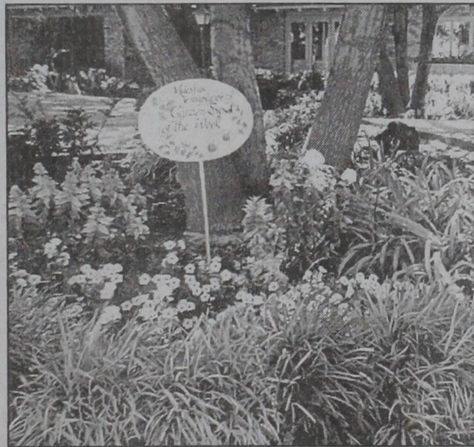
This week's Jennyslippers 'Garden Spot of the Week' is this shaded flowerbed located in the front lawn of Phil and Patti Kent at 314 West 20th Street.

Discussion covers a broad spectrum from weather, pest problems and, of course currently, High Plains production acreage for the 2003 crop, crop development and acreage losses. Anyone interested is invited to attend.