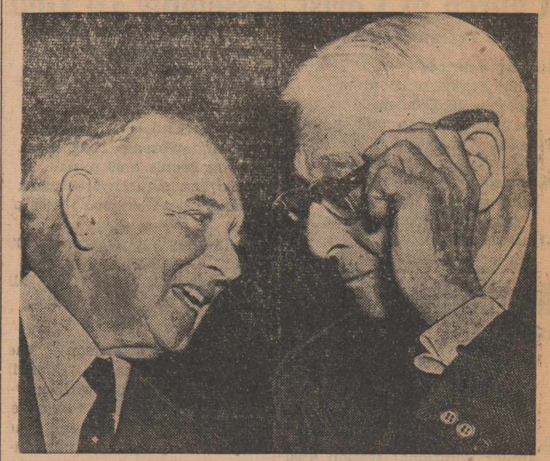
Baruch (right) chats with Sen. Harry Byrd (Va.), advising freezing wages, prices and profits, with no tax reduction.

The modern Olympic Games were first held in 1896