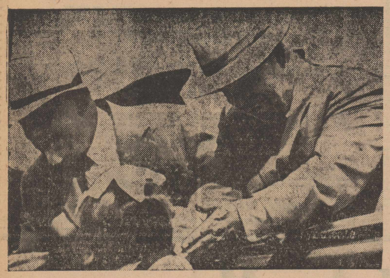
BOYS WITH MESSAGE . . . Soviet Premier Bulganin and Communist party boss Khrushchev greet people of Cierna on visit to