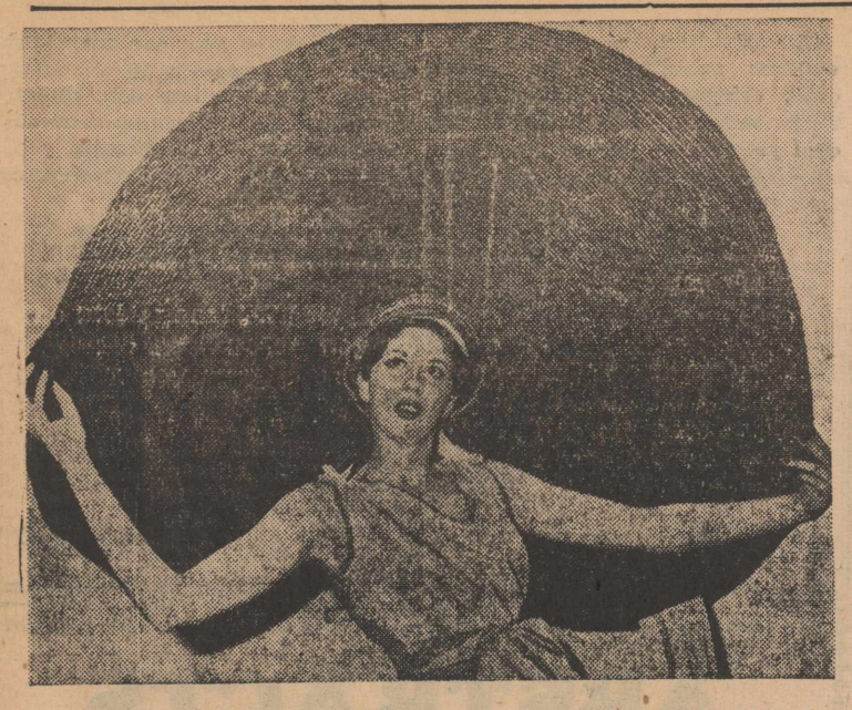
GIANT HAT . . . Largest straw bonnet ever made on Isle of Capri is displayed at Italian fashion show in Munich, Germany