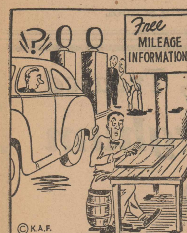
"He uses a ouji board for his road

That's the way we treet our important, we KNOW HOW to care for your CAR. Get the habit of driving in regularly.