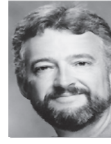
Focus On Faith Curtis Shelburne

According to an 18-year-long study presented at a meeting of the American Heart Association, "people with a high frequency of religious participation in young adulthood were 50 percent more likely to become obese by middle age than those with no religious participation in young adulthood."