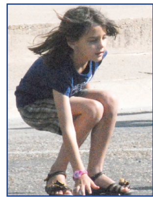
(Watch for additional photographs next week.)