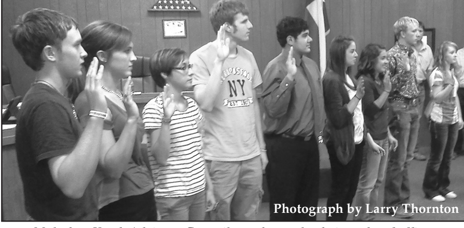
Photograph by Larry Thornton