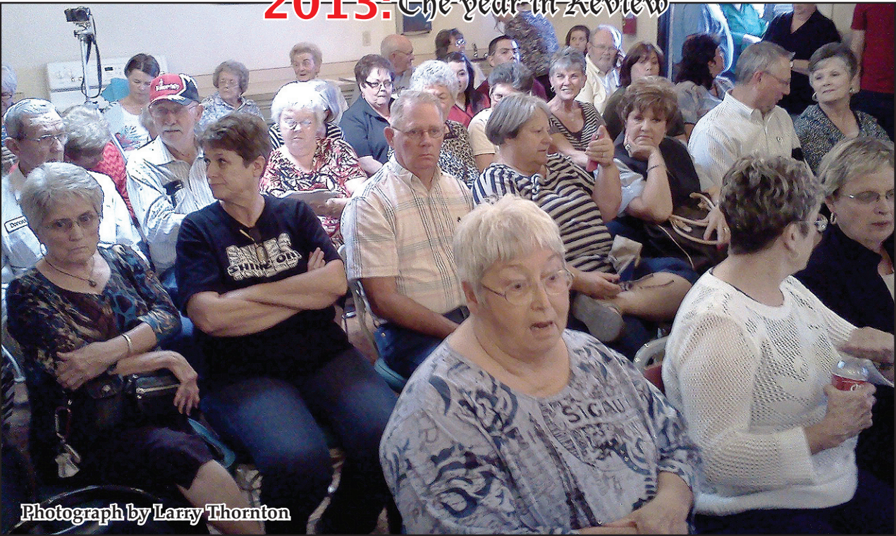
Bailey County residents and hospital employees filled the Muleshoe Area Hospital District's meeting room Tuesday, Oct. 1, anxious to voice their opinions about the long-pending contracts with two local physicians.

officials to hold off on a burn ban such as that which dimmed 2012 festivities.