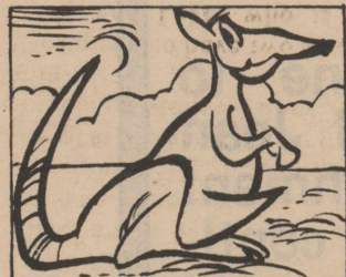
A kangaroo cannot jump if its tail is lifted off the ground. It needs its tail for pushing off.