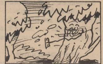
Trees more than 4,000 years old can be found in California's Inyo National Forest.