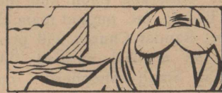
A walrus can easily sink a small boat with his tusks.