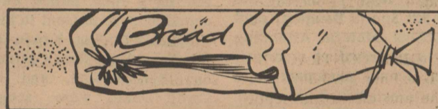
A rib of celery kept in the bag with bread will keep the bread fresh a longer time: