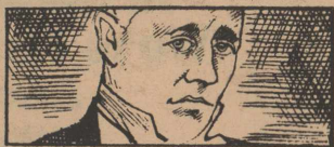
James Buchanan, the nation's 15th president, lived through the administrations of seventeen chief executives - from George Washington to Andrew Johnson.

We ask your support in this new endeavor. In the meantime, as the printer's ink perks toward the debut of the new publication, Country Folk will keep you posted week to week on agri-business.