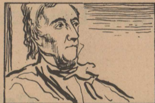
John Tyler fathered more children than any other U.S. president - eight by his first wife, and seven by the second. He was the first vice president to succeed to the presidency.