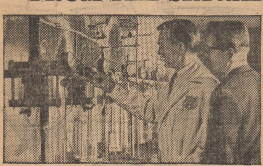
FOR MILITARY USE Phillips originated new superpower aviation fuel components-Di-isopropyl (pronounced di-iso-pro-pull) and HF Alkylate. These made possible more powerful fuels for combat aircraft.