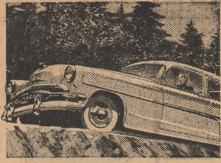
punch for traffic and passing, big-car steadiness and sports car handling ease assure matchless performance thrills.

Pontiac provides Dual-Range Hydra-Matic, Power Brakes, Power Steering,