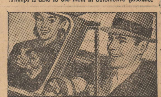
GET PHILLIPS 66 FLITE-FUEL at any station where you see the orange and black Phillips 66 Shield. Let your car's performance show you how good this new gasoline is! PHILLIPS PETROLEUM COMPANY