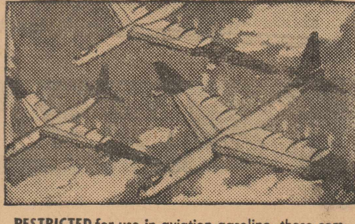
RESTRICTED for use in aviation gasoline, these components have for years been on U. S. Government priority. But now restrictions have been released and Phillips is able to use them in automotive gasoline.