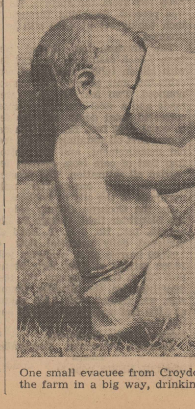
One small evacuee from Croydon, England, beats the heat down on the farm in a big way, drinking direct from the old water bucket.