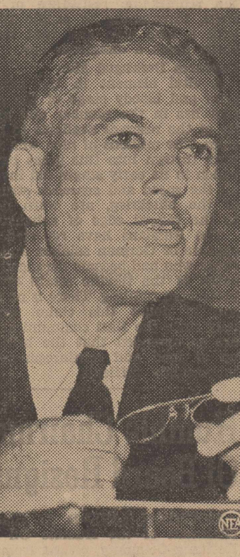
New job for Rexford Guy Tugwell will send one-time brain trust storm center to Puerto Rico as governor.