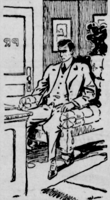
With a Groan He Sank to a Chair.