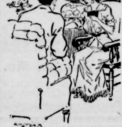
"You Are Sure of That?"

No scheming promoter or "Not sufficient funds" man had ever "put it over" on Jarnigan. He had the record of the bank for sizing up a borrower just right, and shutting him off dead short at the first hint of shrinking deposits or insipid collateral.