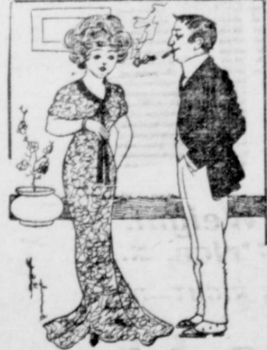
THE HAPPY FAMILY. Hubby—Only two weeks ago I paid for a new fall suit for you.

It is said that when a Scotsman leaves old Scotia to make his home in some other land he solaces his exile with the book of Robert Burns poems, and that the Scot abroad comes to be even better versed in the rhymes of the peasant poet than the Scot who has remained at home.