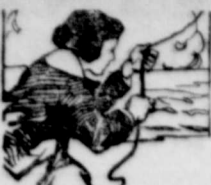
The Wind Blew Toward the Ocean