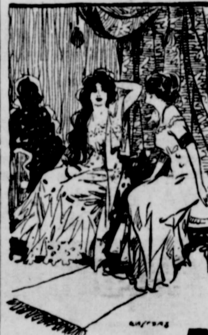
"Everybody Loves You."

"Gloria has promised to sing every Wednesday night," Miss Caroline told him, "and Harold Cartwright on Fridays. Gloria will give the Germans Wagner and Harold will give Italians Verdi, and now and then we will mix the two and have a grand concert."