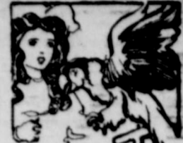
Polly Fluttered Down From Her Perch.

Polly's Tantrum Cures a Cross Little Girl