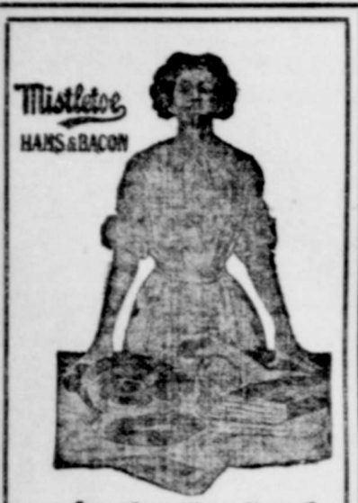
"WHAT EVERY WOMAN KNOWS"

Kansas City Omaha St. Paul Fort Worth Harrison Station, Newark, N. J.