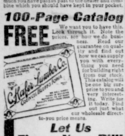
Figure Your Bill!