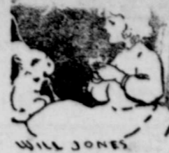
She thanked the Squirrel

"ONCE upon a time," began daddy, "there was a pretty little girl who had the sunniest disposition in the world. Every one loved her, and when she went out into the fields and woods the birds and the animals and the flowers all seemed to know that she was their friend."