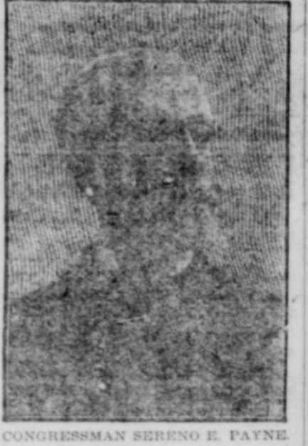
CONGRESSMAN SERENO E. PAYNE

Washington, Feb. 17.—The house yesterday entered an emphatic protest against the action of the senate in amending the agricultural appropriation bill so as to interpret the drawback feature of the Dingley tariff act affecting wheat. By a vote of 261 to 5 the bill was sent back to the senate.