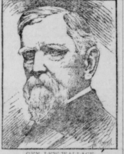
GEN. LEW WALLACE

Crawfordsville, Ind., Feb. 17.—Surrounded by his family, Gen. Lew Wallace, author of "Ben Hur," "The Prince of India," and other works, one-time minister to Turkey and a veteran of the Mexican and civil wars, died at his home in this city last night, aged 78 years.