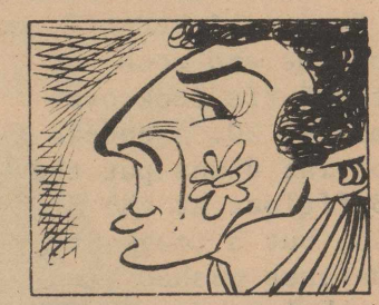
Facial tattooing was original inally used, historians say, not only to beautify the wearer but to conceal expressions of fear from

The writers of this 1980 SAN ANGELO BUSIN-ESS REVIEW recommend Over 21 Years Experience TRIPLE A MUFFLER SHOP to all our friends and