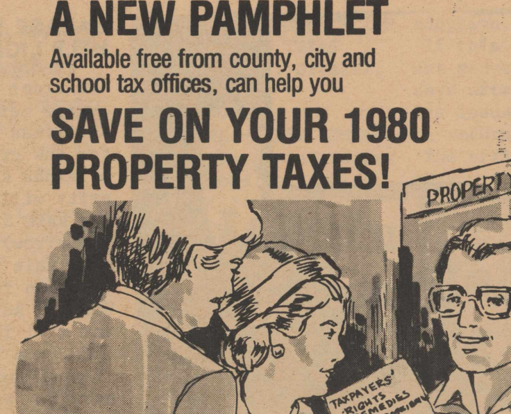
PICK UP YOUR COPY TODAY OF TAXPAYERS' RIGHTS, REMEDIES AND RESPONSIBILITIES!