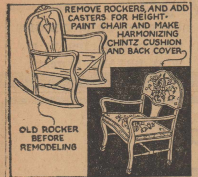
After the rockers have been removed, it may be made to change character to suit the material used for cushion and back covers.

IN TODAY'S cramped living quarters there is little space for a rocker that neither harmonizes with antiques nor modern furniture. Yet, with the slight alterations shown here, such a chair may be made to seem at home with either type of furniture.