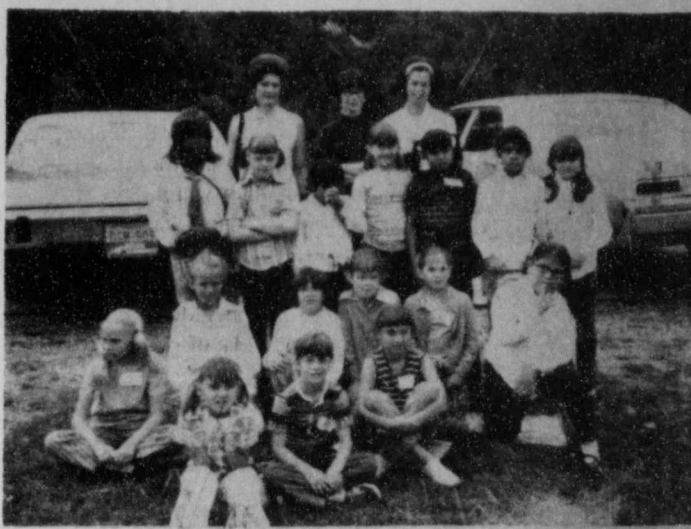
ROTAN BROWNIES: This group of Rotan Brownies and leaders attended Girl Scout Camp at Sweetwater last Saturday.