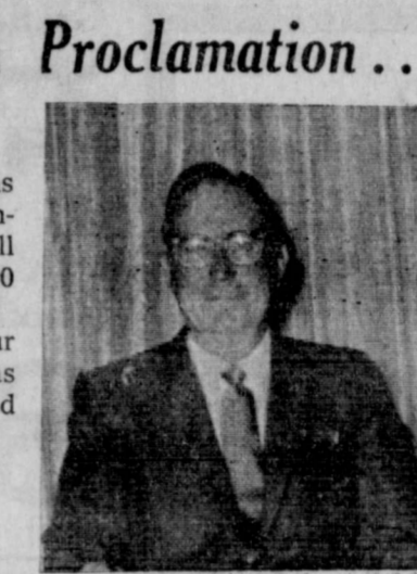
Mayor Signs Proclamation