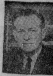
WASHINGTON "As it looks from here" OMAR BURLISON Congressman 17th District

Washington, D.C. — The Social Security act was amended in July, 1965, establishing the Medicare Program which, among other things, provides eligible individuals at age 65 or over with basic protection against the costs of services provided by hospitals which meet certain conditions of participation.