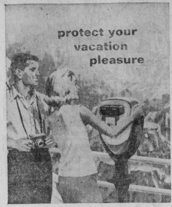
carry "the safe money"