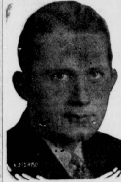
ALLAN SHIVERS of Jefferson County

Senator Allan Shivers will officially open his campaign for lieutenant governor in Fort Arthur, Thursday, June 27. Dean of the Texas Senate and World War II overseas veteran, his speech, which will be broadcast over the Texas Quality Network, 8 to 8:30 P.M., will be of interest to every voter in Texas.