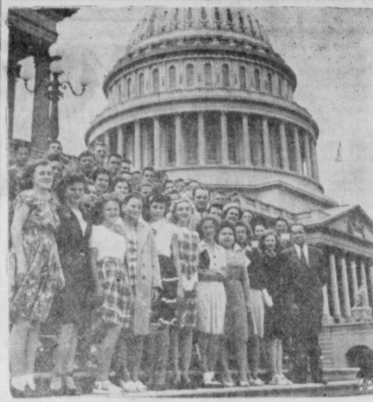
TEXAS HIGH SCHOOLERS VISIT CAPITOL—Rep. Lyndon Johnson (center in group) of Johnson City, Tex., stands with group of students from Elgin.